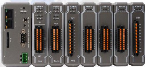
(I/O modules not included)